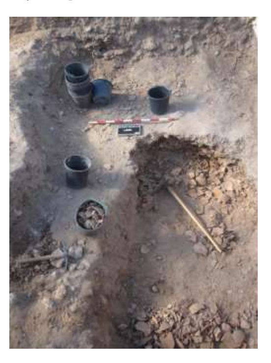
Figure 4. Ceramics and glass deposit, associated with postulated industrial activity (L2051, Sq. B5).