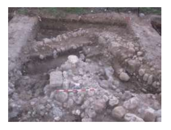
Figure 3. Substantial walls and paved surface, Sq. A10.

is punctuated by a concentration of larger walls and substantial artefact deposits near the north end of the site. Further north, all architectural remains trail out and the northern 25-30m of the area see very few features.