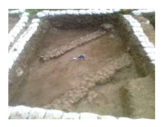
Figure 2. Non-specifiable walls in Sq. A14.

This is indeed what we recovered urban remains dating mostly to the Byzantine period, as well as some fairly sparse Early Islamic, Ottoman-period Mamluk and architecture. Most of the features were state in а poor preservation, lacking specifiable function (Fig. 2). However, some structures appeared 'public' in nature - that is, substantial walls constructed of dressed stone façades, often plastered (Fig. 3). At other locations we found large deposits of ceramics, glass and glass slag, which we believe may mark 'industrial' activity of some sort pottery and glass workshops, perhaps.