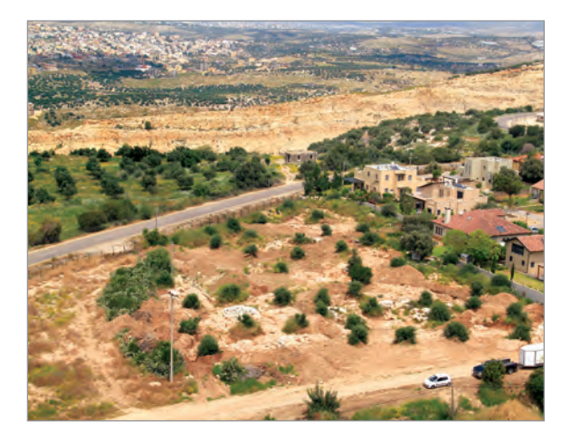
Figure 1.3. Area A (facing northeast).

Musharef would later be built over the church.