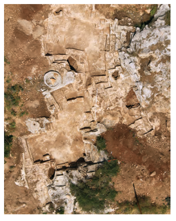
Frontispiece. Left: Some findings from the Iron Age tomb. Right: aerial photograph of the F12 quarry.