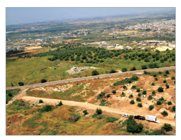
Figure 1.4. Area A (facing north).