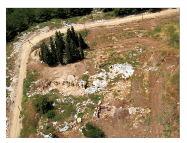
Figure 1.6. Area B-west (facing west).