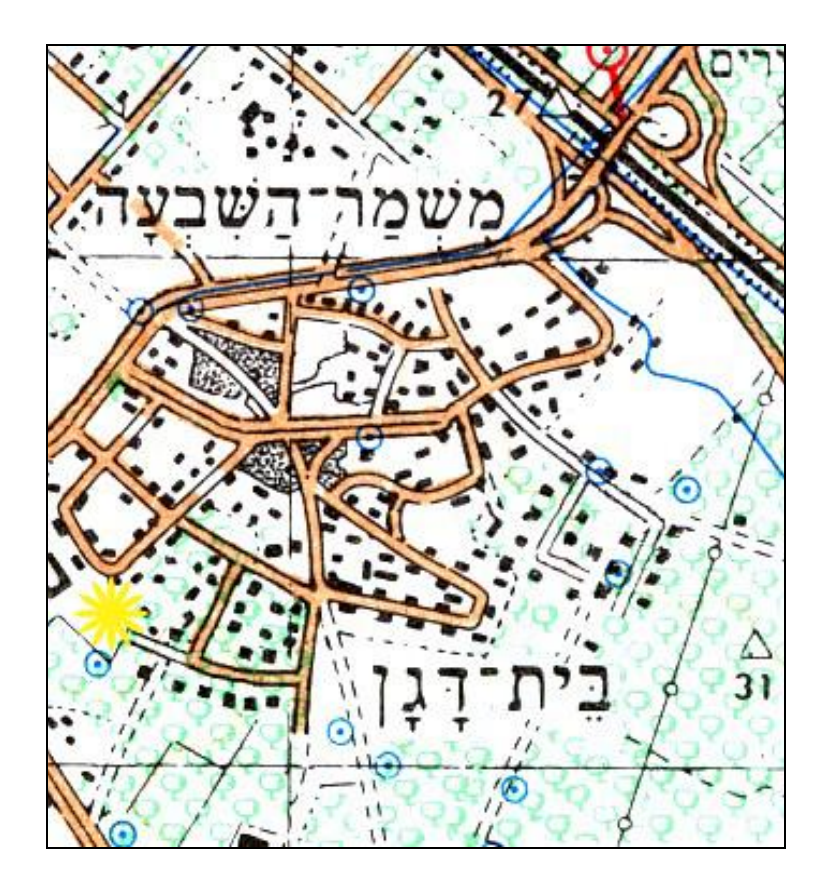
Location map of Bet Dagan excavation site (31°59'55''N / 34°49'33''E).