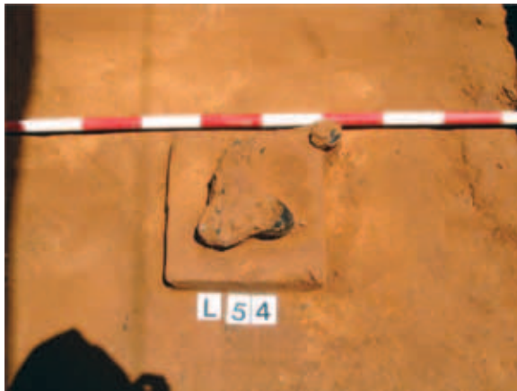
Fig. 4. Blue glass vessel fragments.

stood out clearly against the hamra soil and yellow sand. In these built graves too (and the surrounding area), very few artifacts were discovered, making it difficult to date them. However, two fragments of blue glass bottles were found (Fig. 4), and a very limited number of probable Mamluk ceramic body sherds which were incorporated with the mud bricks (Fig. 5). It is possible that the area was settled as part of the hinterland of Late Roman