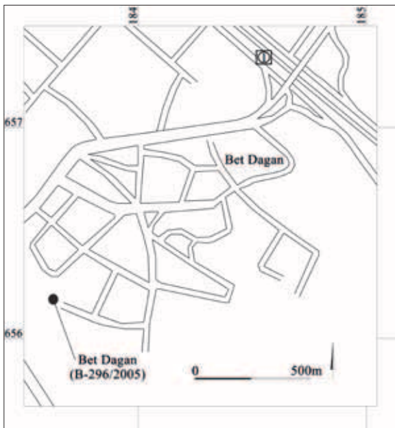
Fig. 1. Location of the excavation site (183600–656150).

Esther Deutsch. The excavations were halted twice following legal court orders by the El-Aqsa Corporation. For this reason also no physical anthropology investigation was conducted of the graves (which were never excavated). At an