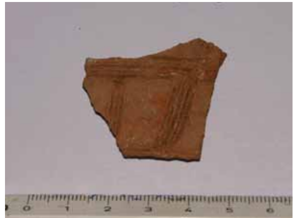
Fig. 5. L11, B.2, Mamluk pottery sherd.