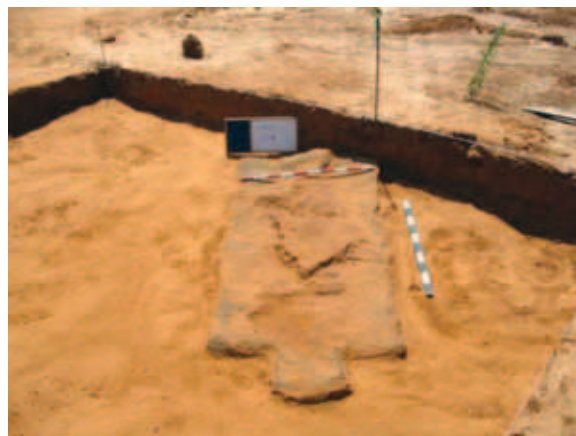
Fig. 3. A general view of brick-lined grave L18.

This square was dug to a depth of approximately 0.6m. In it the remains of three gray mud brick graves (L12, L13 and L18) were found. The preservation of the westernmost grave (L18) was the best (Fig. 3). Its entire upper brick cover was intact. The grave measures 2.2 x 1.0m and is oriented approximately east-west. Halfway along its eastern side a bulge of mud bricks was found. The grave was not excavated. The two other graves were damaged and probably collapsed; from them