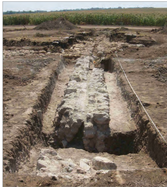
Figure 1. General view of the excavated aqueduct (facing southwest).