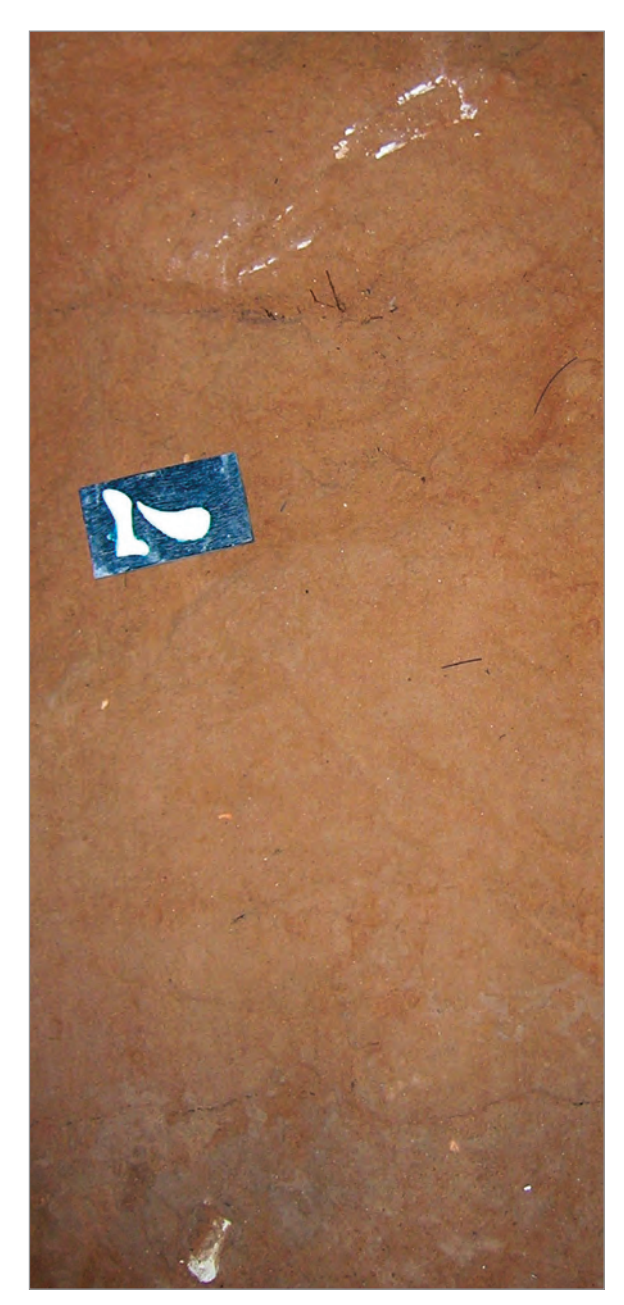
Figure 6. Grave 7.