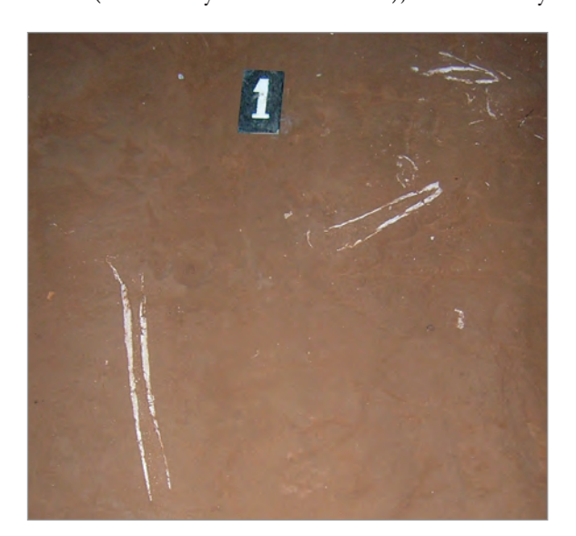
Figure 1. Grave 1 (facing south).

This grave contained human bones only. The bones were found without anatomic articulation. Yet it appears that this grave was a primary burial which had been disturbed. Skeletal remains included postcranial bones (of the body without the skull), of which only