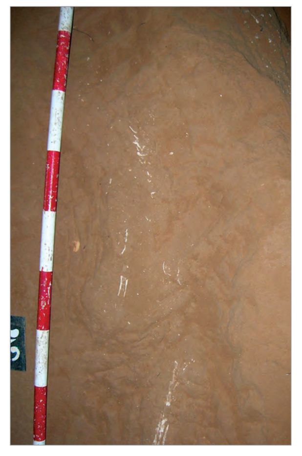
Figure 2. Grave 2. Vertebrae visible in the upper center.

This grave included human bones found in primary burial and in articulation. They included only postcranial bones, from the upper and lower parts of the