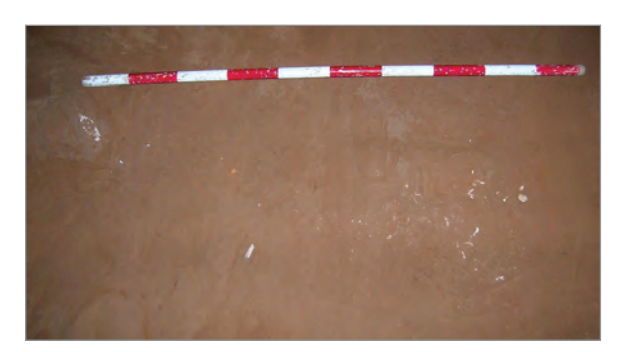
Figure 3. Grave 3. Remains of skull and teeth on the right side.