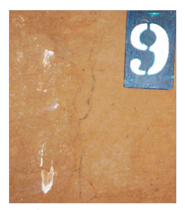
Figure 8. Grave 9.