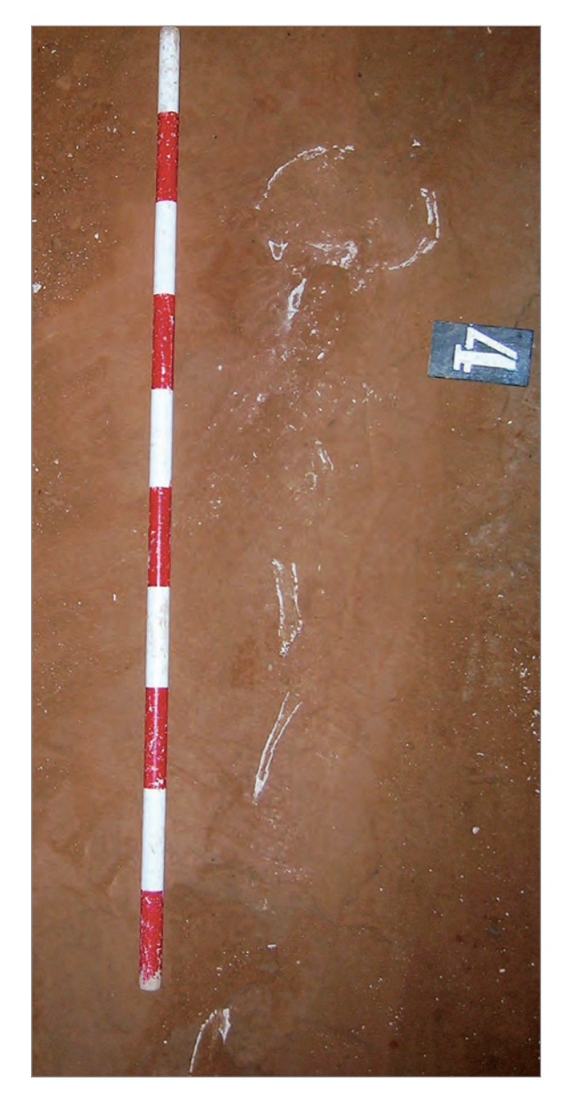
Figure 4. Grave 4.

body (Fig. 2). The body was oriented northeast/south-west, the head to the southwest. From the length and thickness of the bones it can be assumed that this individual was an adult, i.e. older than 15 years of age. The gender could not be determined.