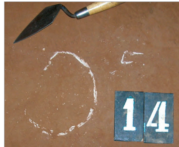
Figure 13. Grave 14.

its circumference it is possible to estimate with some confidence that the individual was an adult, i.e. older than 15 (Bass 1987).