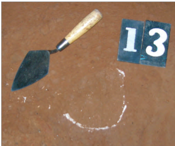
Figure 12. Grave 13.