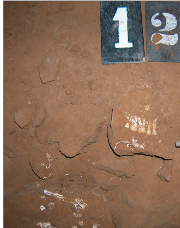
Figure 11. Left: Grave 12. Right: Close-up of the Grave 12 teeth.