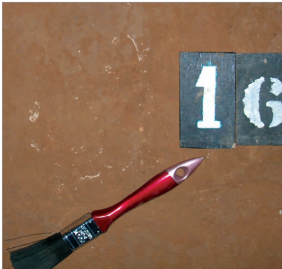
Figure 15. Grave 16. Teeth visible on the left side.